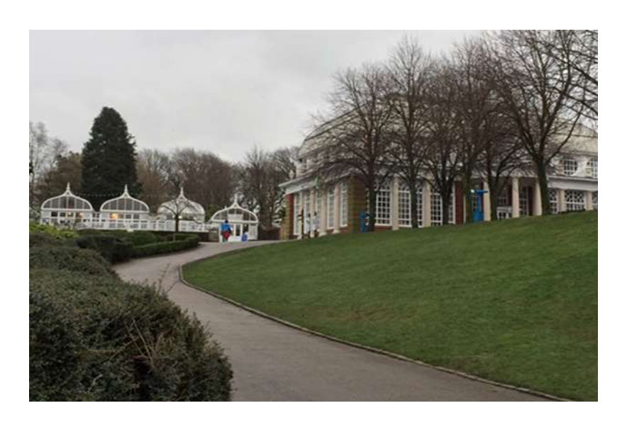
A flat surfaced hill walk to our fantastic facilities

Entry to The Butterfly house is through our gift shop. The café has its own door but is also accessible from the shop. All have double doors that can be easily entered. Floor surfaces are smooth and without steps. Entrance to the mini-beast cave is up a ramp and although the paths in and around the Butterfly House and gardens are narrow, pushchairs and wheelchairs are able to manoeuvre around.