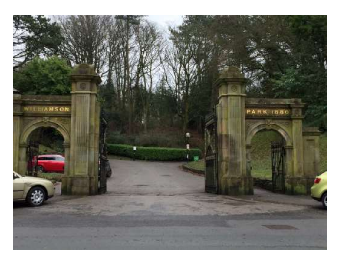
Quernmore Road Entrance which leads to parking including disabled parking,

There are two pay and display car parks in Williamson Park - at the Quernmore Road entrance (15 spaces, including disabled parking) and at the Wyresdale Road entrance (100 spaces).