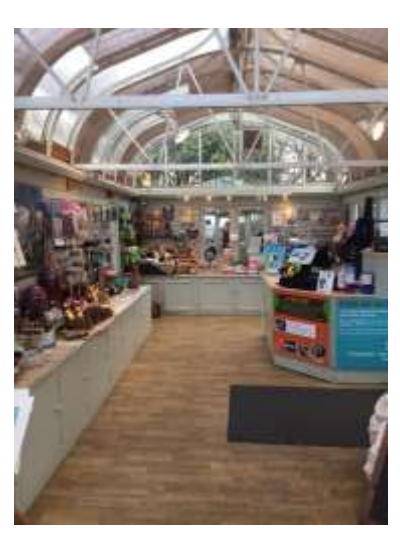
The Gift Shop