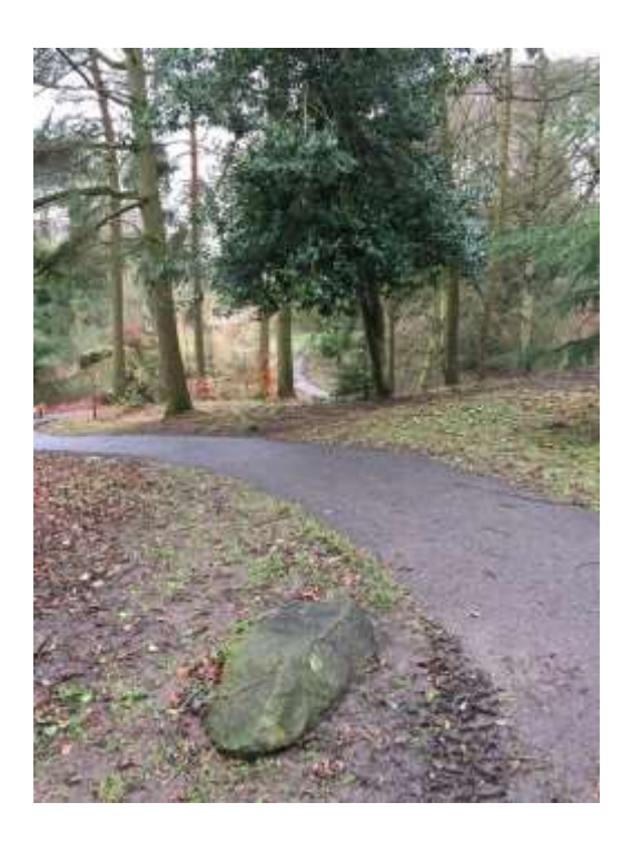
Example of tarmac paths