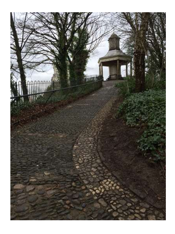
Cobbled path to The Temple

The park is a stunning example of natural beauty, we ensure that the paths are clear but are in keeping with the scenery. Originally Williamsons Park was landscaped from an old quarry by James Williamson in 1880. This has left many undulations and levels to the landscape. Many of the paths and walk ways are tarmac and easily accessible if walking around the different areas of woodlands. We must point out that there are several steep hills around the park, along with steps to many of our shelters and The Ashton Memorial. At dusk the main walk ways are lit with lamps.